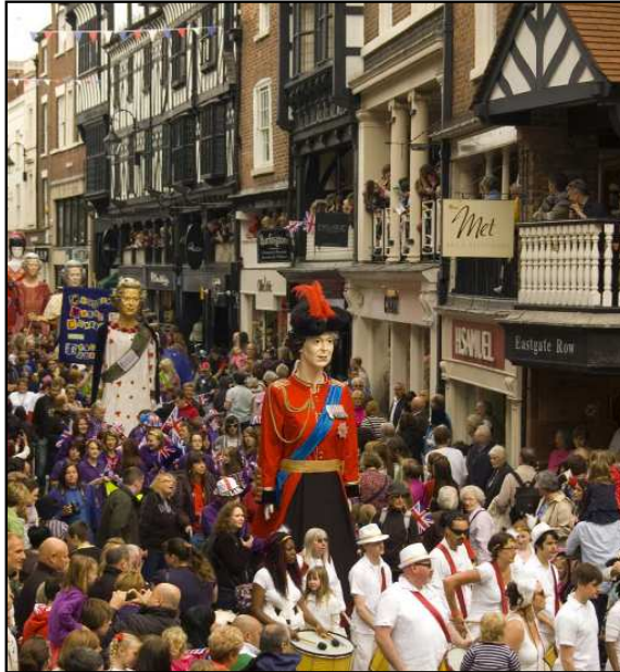
Check what's on in Chester - a city of many public spectacles. This was their parade of giants passing The Rows

In the other direction is Chester, just 22 hours cruising, which makes it easily accessible on a week's holiday. Once again the canal puts you in the heart of the city, within sight of the City Wall which can be walked in its entirety. A Roman amphitheatre, the fascinating two-storey Rows in the centre, partly mediaeval, partly Victorian reconstruction, a famous racecourse and the lovely River Dee, flow-