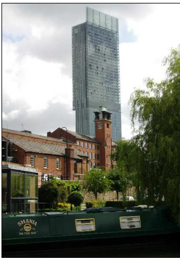
Manchester's Castlefield basin with Bentham Tower above it.

The canals connect you to more than just the water.