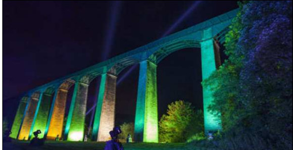
The Pontcysyllte Aqueduct, lit for a celebration.

Skirting the outer edges of Wolverhampton you may even catch a glimpse of the new Jaguar Land Rover factory that is boosting manufacturing in this Black Country town. You are soon out in the country again with more villages like Compton (try the fish and chips) and a fascinating piece of canal history at the Bratch flight – which looks like a staircase of locks but technically isn't. Kinver with its cave dwellings is worth a pause and Kidderminster is an ideal place for stocking up on essentials as the canal passes the doorstep of large supermarkets.