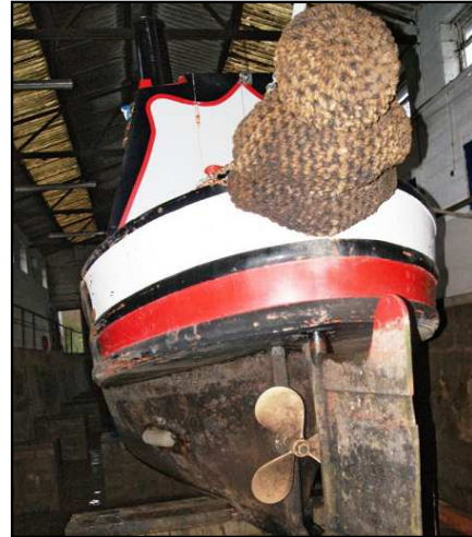
Get your stern gear checked whilst your boat is high and dry

Whilst the boat is high and dry Norbury can also repaint of counter bands as well as gun-whale tops and sides and front return plates. Replacing anodes, stern gear refurbishment