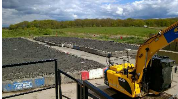
Dredging waste drying out at the new testing site.

The site has been set up in partnership with Land & Water and FCC Environment Ltd, and the trial is part of investigating the need for, and viability of, setting up a network of such sites. The first 3,500 tonnes of dredged material was taken to the new site in March (with more arriving throughout the year) and the Trust will be monitoring how quickly and efficiently it takes to dry out. The site includes drying lagoons which drain the wet dredgings.